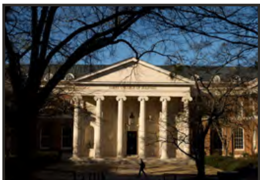
Brooks Hall, Home of the Graduate School

Established in 1910, the Graduate School oversees all of the graduate programs offered at UGA. Our faculty and administrators coordinate world-class graduate programs so that you receive a quality education in addition to a valuable graduate degree. The Graduate School works to create a smooth transition for new students while providing support throughout the duration of the graduate student experience from recruitment to graduation.